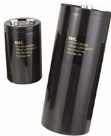
Long life/high ripple electrolytic capacitors Series ALSxx, ALCxx

In a power converter or motor drive the power source is DC (or converted to DC). The DC link capacitor acts as a "buffer" between the power source and the inverter. A typical hybrid vehicle is shown. Though the power source and output may vary, the same principle applies to wind turbines, solar converters, and industrial drives.