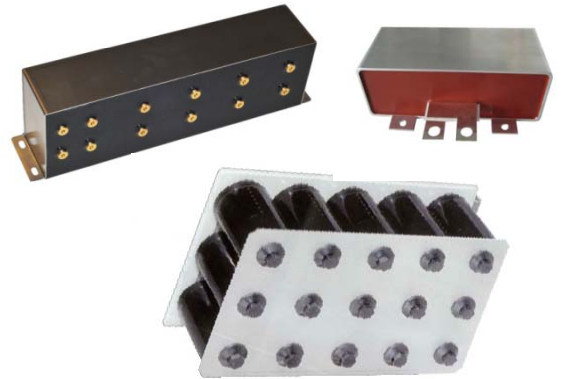
Custom film and electrolytic solutions