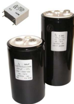
Film capacitors for all power levels Series C4AE, C4DE, C44U